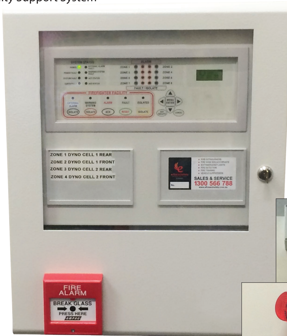
Supervisory Fire Panel

Photos are for representation only, actual product may differ slightly depending on your requirements.