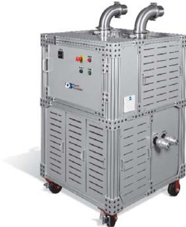
Optional Charge Air Cooler