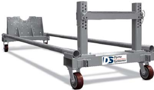
Optional Engine Cart