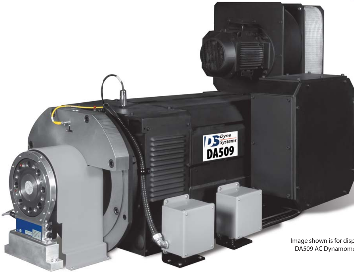
Image shown is for display only, actual DA509 AC Dynamometer may vary.