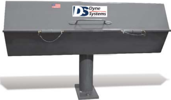
Optional Driveshaft Guard