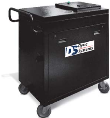
Optional Closed Loop Cooling Center