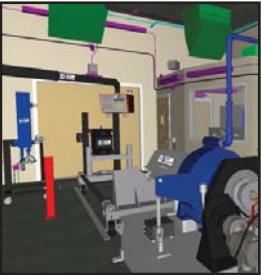
Design, Project & Construction Management Services