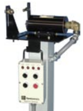
Actuator Stand and Remote Throttle Control from outside the test cell

Differential Testing: A unique setpoint entry interface is available to simultaneously send speed setpoints to two dynamometer controllers connected to the axles of a differential.