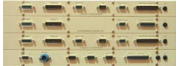
Back of Inter-Loc V, showing 3 Modules:

Dyne Systems has been developing digital dynamometer and throttle controls since 1982. These have been traditional designs with separate dynamometer (Dyn-Loc I through IV) and throttle (DTC-1) control boxes. When it came time to design our next-generation control, we chose to make it a single box that could be either or both – hence, “Multi-Loop Control.” This results in a control that can be configured in many ways, and is ideal for a wide range of applications, including dynamometers (engine, chassis, and electric-motor) and test stands (differential, transmission, gearbox, and others).