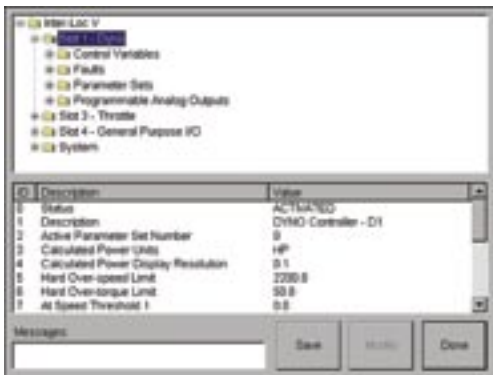
Setup Menu: Interface allows easy configuration

The Inter-Loc V's Operator Control Station includes a full VGA active matrix color LCD with touchscreen interface, and only uses 5¼ inches of rack space. Also available in a console. An Inter-Loc V Operator Control Station can be purchased to monitor each controller module that is installed in the Inter-Loc V, or a single Operator Control Station can be used to monitor all installed control modules.